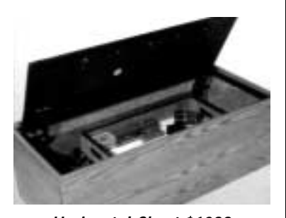
Horizontal Chest $1099 At the foot of a bed or in your game room, AMSEC provides discreet security